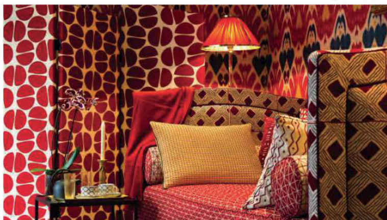
Clockwise from top left: Crystalware by Benito; ValGrine golf putters; Solex bike; Textiles and fabrics from the house of Le Manach. Opposite page: Fauré Le Page clutch bag