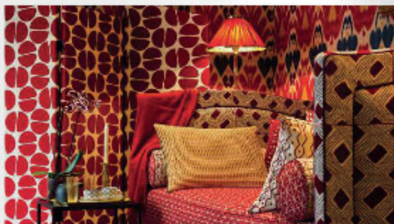
Clockwise from top left: Crystalware by Benito; ValGrine golf putters; Solex bike; Textiles and fabrics from the house of Le Manach. Opposite page: Faure Le Page clutch bag

celebrated its 80th birthday last year. The house's perfumes are poured into flacons from Baccarat crystal fountains, though the house's know-how also lies in its famous Poudre Peau Fine (fine powder) created in the 1930s using an exclusive production method and which continues to be made in the same way, secretly, today. The powder's natural ingredients are ground, blended and sifted several times to obtain maximum lightness and finesse, and they are scented with the fragrance of Bulgarian rose, distilled on the premises. Goose down powder puffs in four delicate colours made especially for Caron are also found in the house's dainty boutiques.